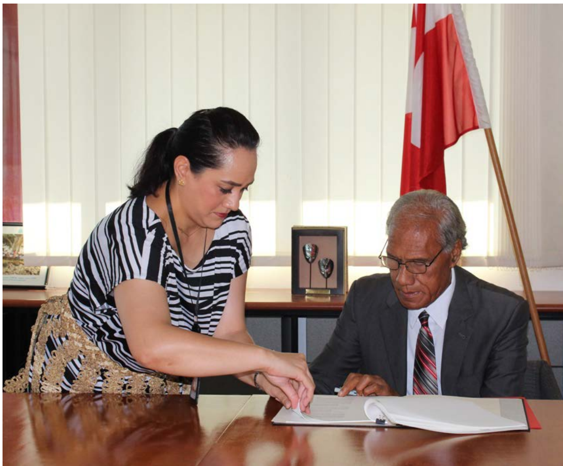
Hon. Prime Minister 'Akilisi Pohiva signing the Exchange of Notes.