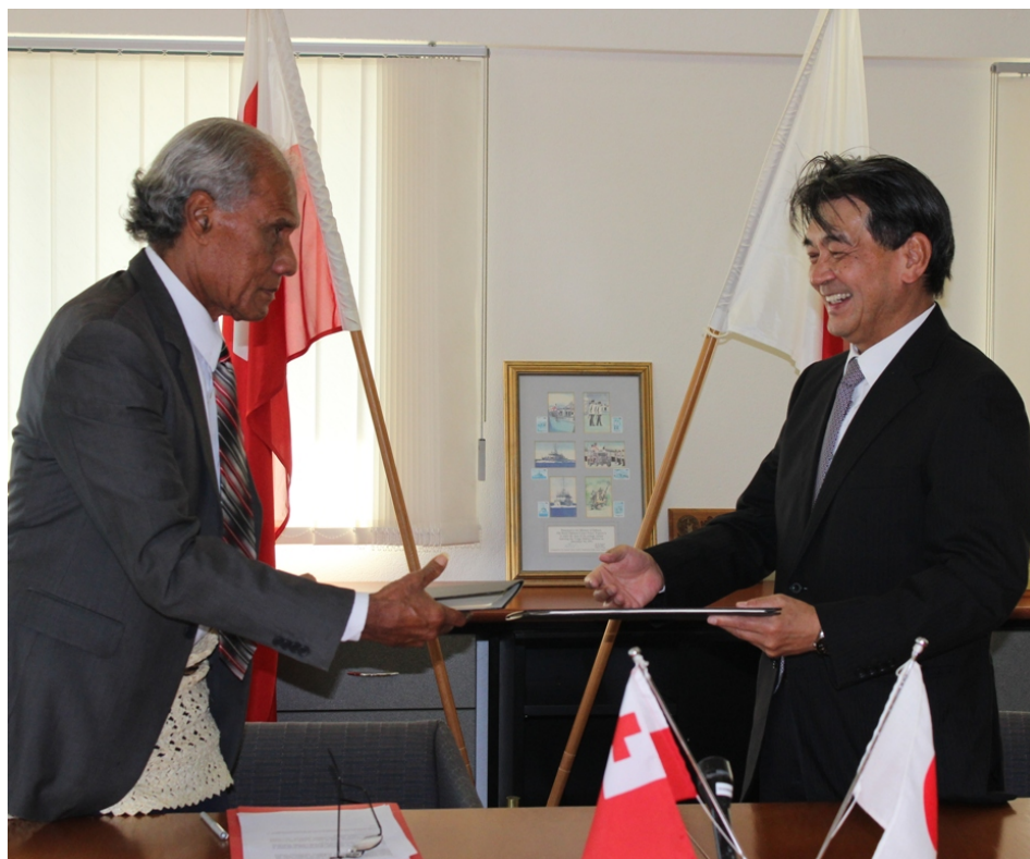
The Sign and Exchange of Notes at the Ministry of Foreign Affairs, in Nuku'alofa.